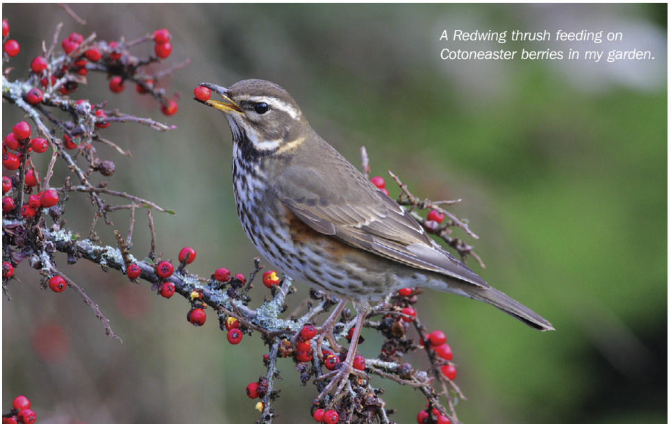
A Redwing thrush feeding on Cotoneaster berries in my garden.

To this end, as winter starts, I remove the old dead tomato plants from my greenhouse and convert part of it into a bird hide. This I do by replacing a pane of glass at one end with a sheet of hardboard in which a hole has been cut large enough for my lens to poke through. This area of the greenhouse is then converted into a dark hide by draping black ground covering material (available from garden centres) from the greenhouse roof. This is light-weight and easily clipped up inside my greenhouse and keeps me in semi-darkness and well hidden. With a padded seat to sit on, it can be a pleasantly comfortable and warm place to spend an hour or so in the winter, even when it is freezing outside.