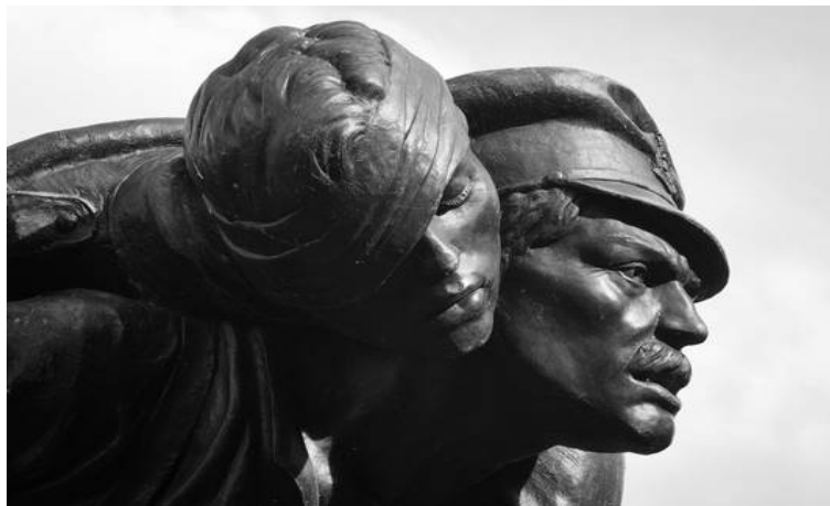
NMA2