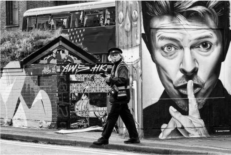
Northern Quarter 089