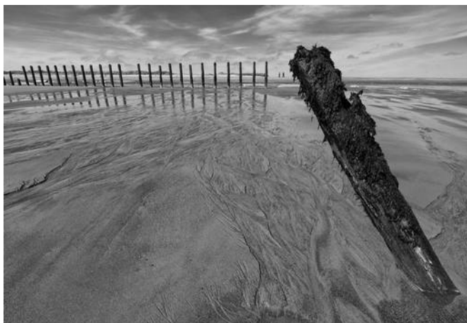
016-Spurn-BB2310