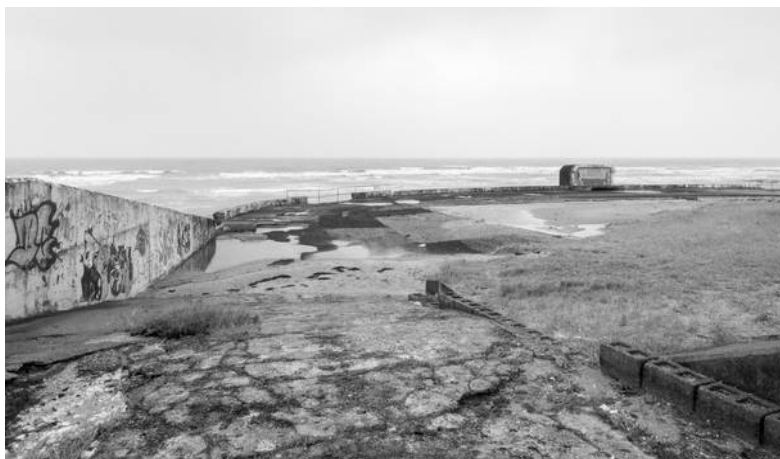
Margate Lido