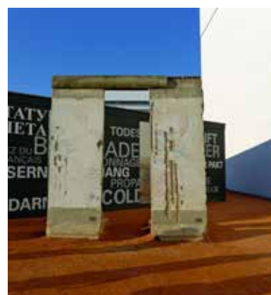
Holiday Snap Berlin