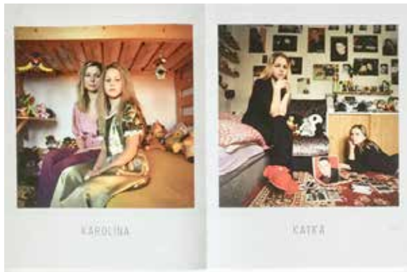
Page spreads from Dita Pepe's book

All are encouraged to put forward nominations. See http://www.rps100heroines.org