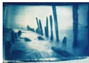
Spurn Point Cyanotype