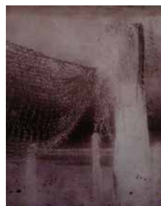
Spurn Point Solarplate Etching