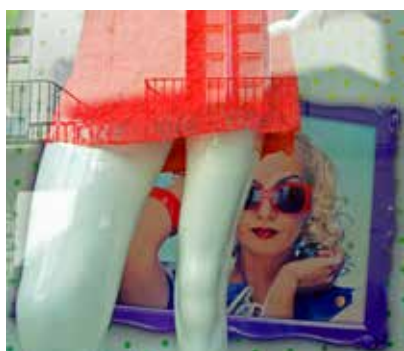
Holiday Snap Velez Málaga