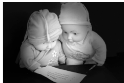
Baby Hackers

Christine Pinnington began by showing a variety of her work, explaining her take on contemporary using photography as a conceptual art form to convey a message. Her work included collages, montages and set pieces ending with a recent work, a montage of images of abandoned shoes mounted in the shape of a boot (complete with laces!)