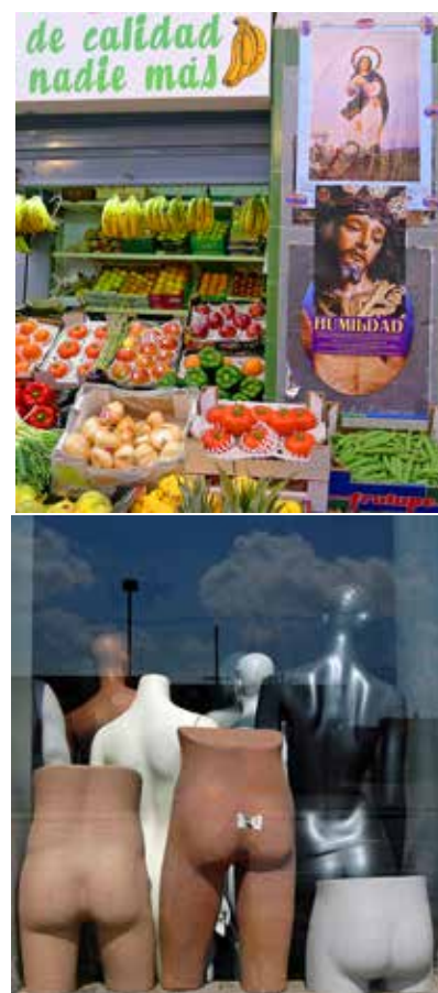
Holiday Snap Tulsa Oklahoma

I don't know where this will lead but my heart will always be with the Contemporary Group and the RPS – I'm proud to say that I was awarded an Honorary Life Membership in 2014.