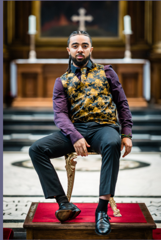
Mark Anthony, Julius Caesar (William Shakespeare)

The suspension of disbelief lets an audience ignore the unreality of theatre. It operates when an actor persuades us, using set, costume, make-up, speech and acting ability, to see that they 'really are' the character they are performing. My images show how much unreality we are willing to ignore - differences in surroundings, gender, skin colour, personality, morals and even biological species. Actors show us the characters they also are; I show the actors that their characters really are