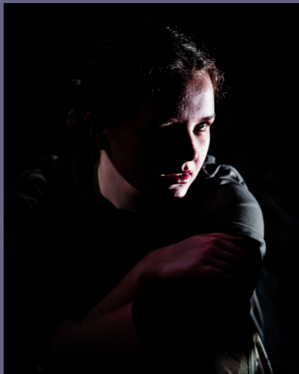
TA soldier, Dunsinane (David Greig)