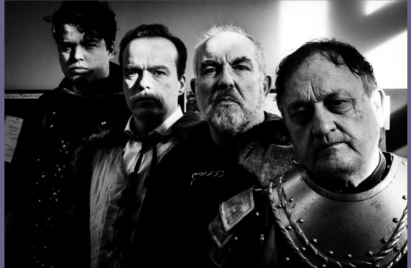
The four murderers, Murder in the Cathedral (T S Eliot)