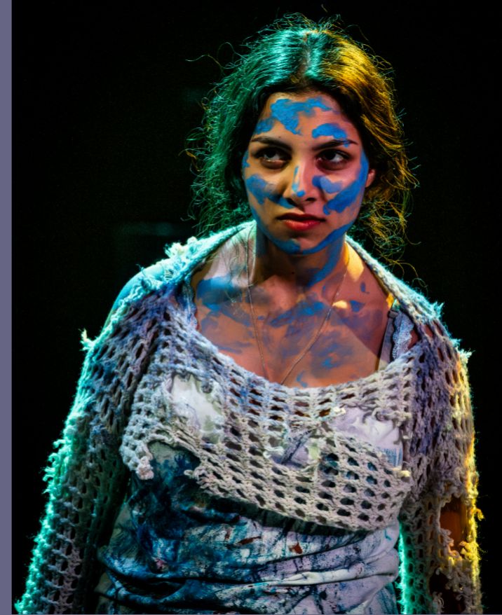
Caliban, a monster, The Tempest (William Shakespeare)